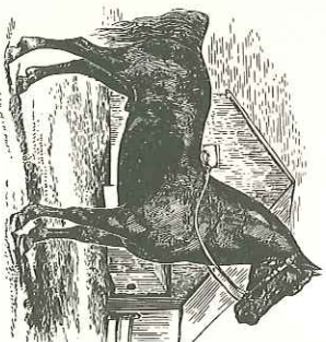
THE MORGAN HORSE The pride and product of America